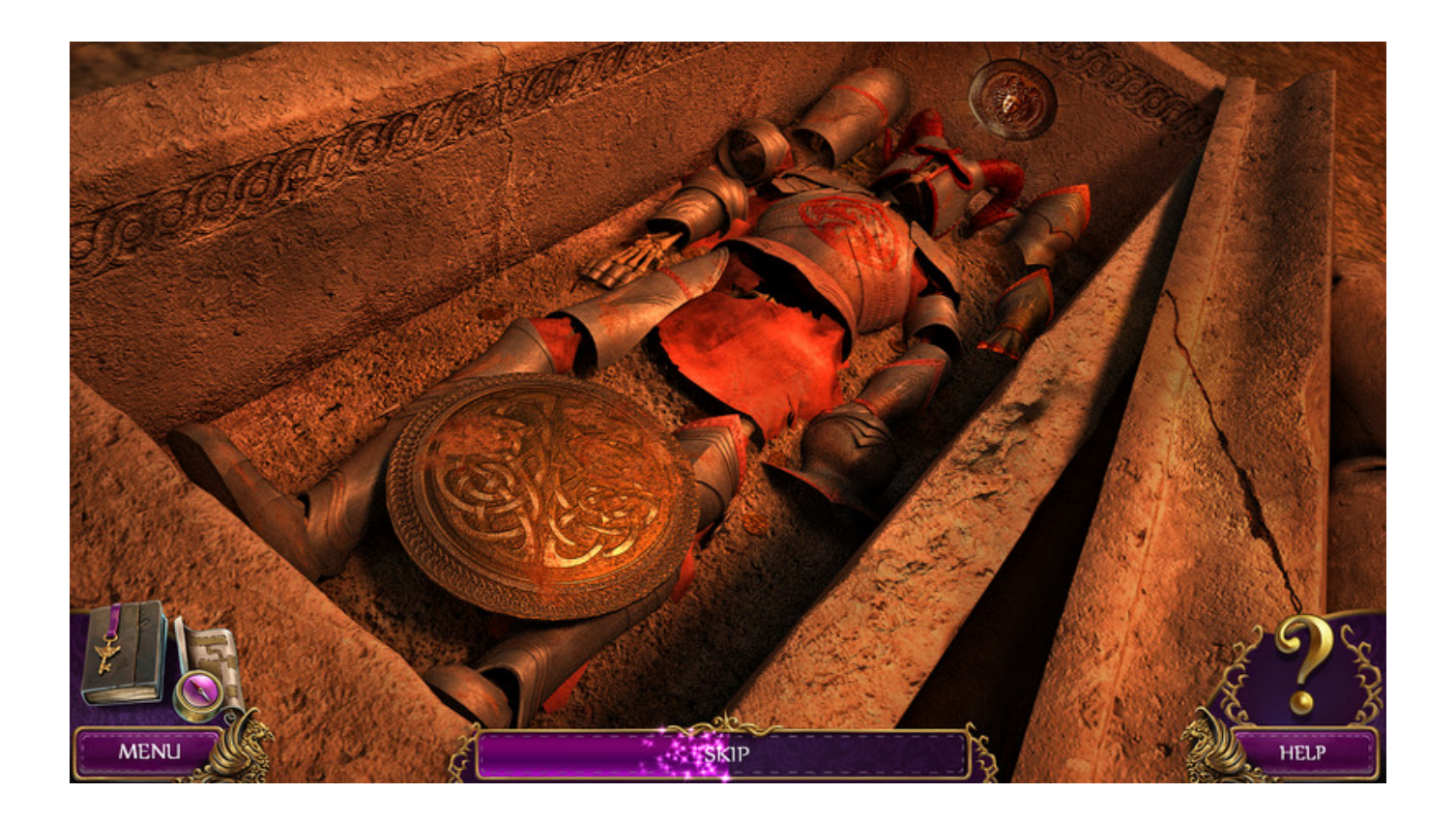
The Secret Order 2: Masked Intent Ativador Download [Keygen]

Download >>> <a href="http://bit.ly/2SGNFli">http://bit.ly/2SGNFli</a>