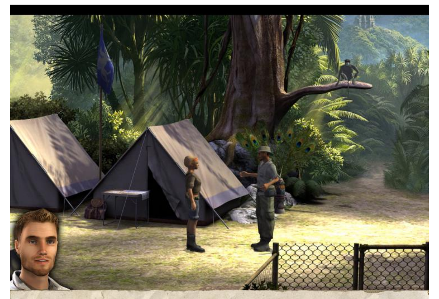
Asleep on my feet, to be honest. But there's a couple of things I'd like to know before I hit the hay, or my curiosity will probably keep me awake.