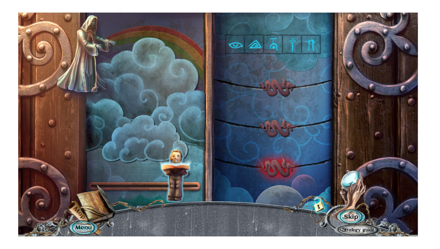
SW4-II - Old Costumes Set Keygen Online

Download >>> <a href="http://bit.ly/2NCbMCK">http://bit.ly/2NCbMCK</a>